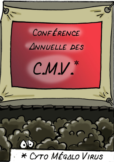
* CYTO MÉGALO VIRUS

HÉWÉ WA DJEMZANGOU, T ARATIBU ZATRU, ZAHU NGIYA WANATSA WALÉ RANGU M'INBANI HA WA MAYDO ZI JILIHANA !!! ZISI NGAMIZIWA !!!