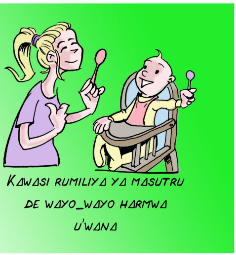
KAWASI RUMILIYA YA MASUTRU DE WAYO_WAYO HARMWA U'WANA