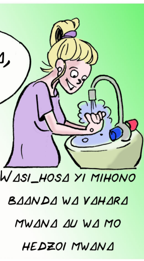
WASI_HOSA YI MIHONO BANDA WA VAHARA MWANA AU WA MO HEDZOI MWANA